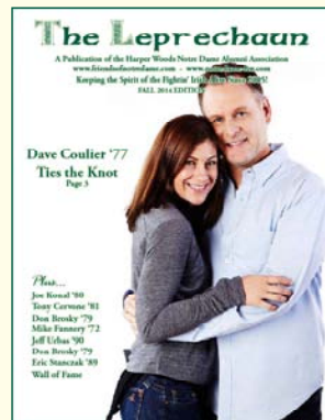
ON THE COVER: Dave Coulier '77 Gets Hitched... Page 3